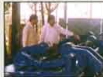
HYDRAULIC PIPE ROTATOR