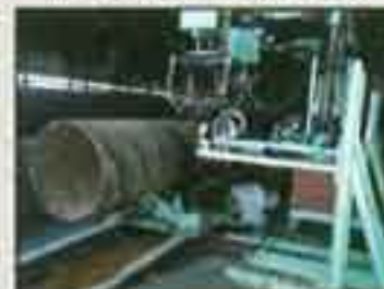
ROTO ADVANCING CONVEYOR FOR U.T.