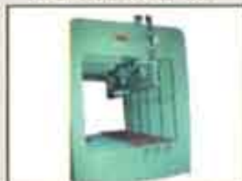
HYDRAULIC PRESS CAPACITY 600T