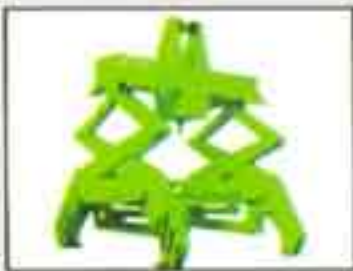
SLAB LIFTING TONG