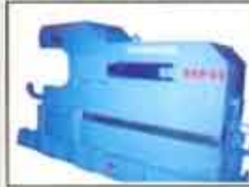
HYDRAULIC BELT WRAPPER