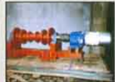
DIABOLIC ROLL CONVEYOR