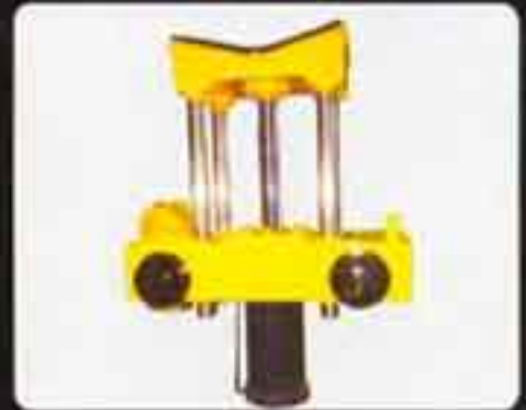
Vertical Pillar Coil Car