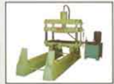
HYDRAULIC CUT OF CARRIAGE FOR CRHR PANELS/SHEETS