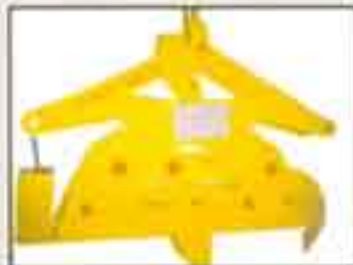
COIL GRAB / COIL TONG