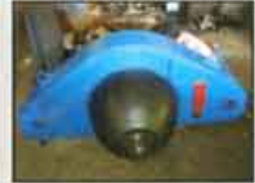
POST-BENDING TOP ROLL FOR SAW PIPE PLANT UPTO 56" DIA