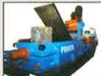
SCRAP BAILING PRESS