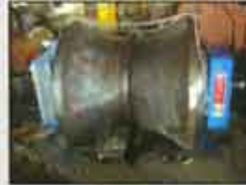
POST-BENDING BOTTOM ROLL FOR SAW PIPE PLANT UPTO 56" DIA