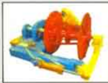
HYDRAULIC SCRAP WINDER