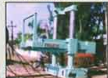
TWIN COLUMN VERTICAL WELDING BOOM