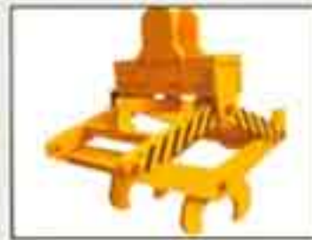
COIL GRAB FOR SOLID DRUM