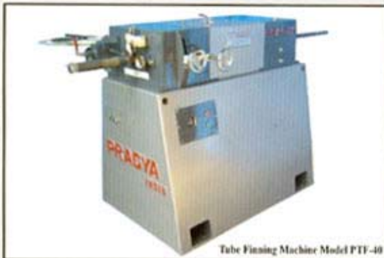
Tube Finning Machine Model PTF-40